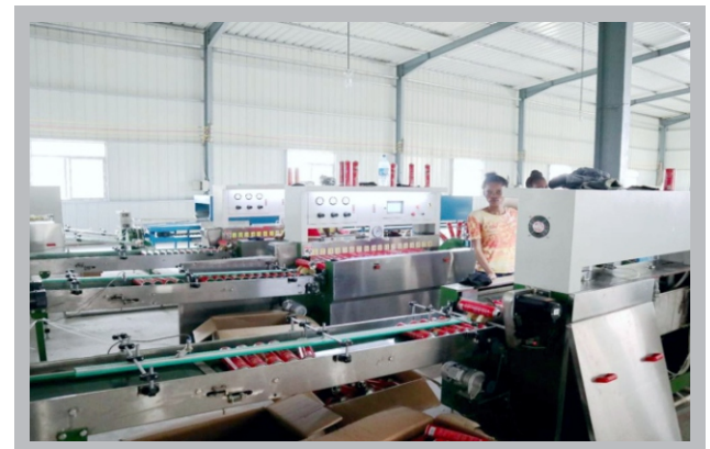
GOLDEN DREAM COMMODITIES FZE: Manufactures baby diapers and insecticide for both local and export market.