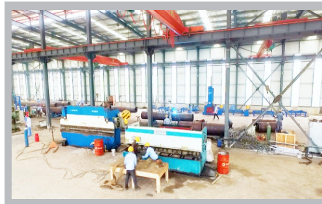
HAUCHANG STEEL STRUCTURE FZE fabricates Steel Structures used in the construction of factories, warehouses and studio