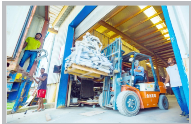
LOVINGHOME FURNISHING FZE specializes in manufacturing Executives Chairs for Nigeria market