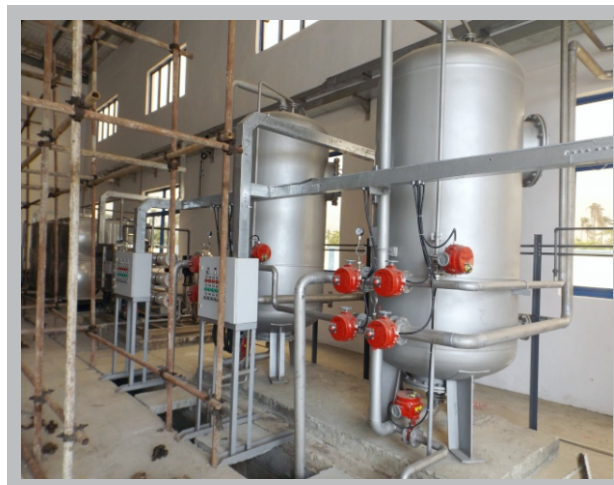
Water Treatment Filtration Unit