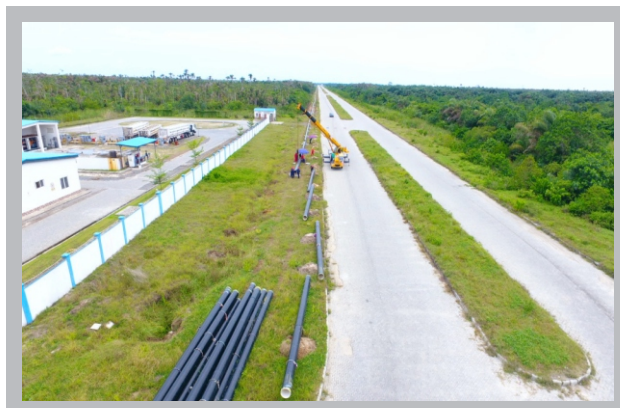
Water Pipe Installation