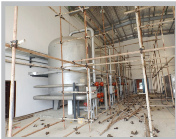
Water Treatment Filtration Unit