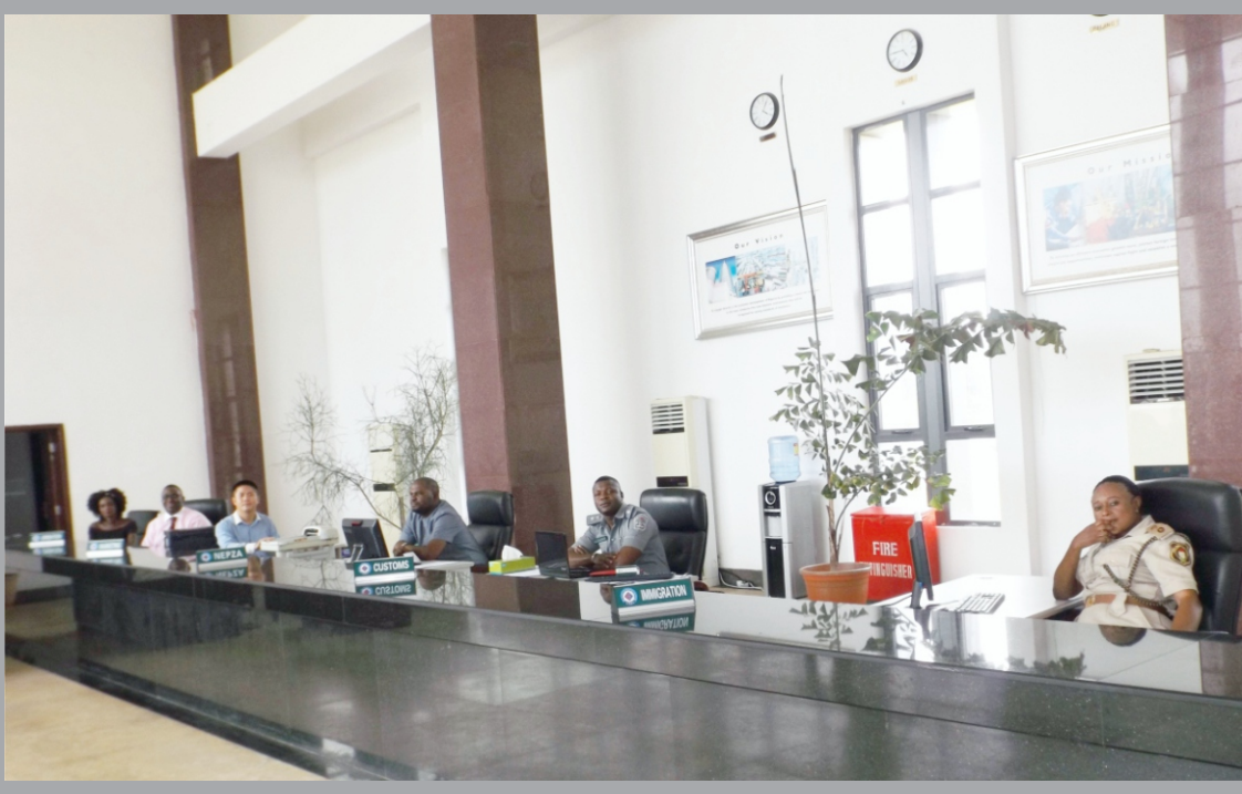
One-Stop Service Center