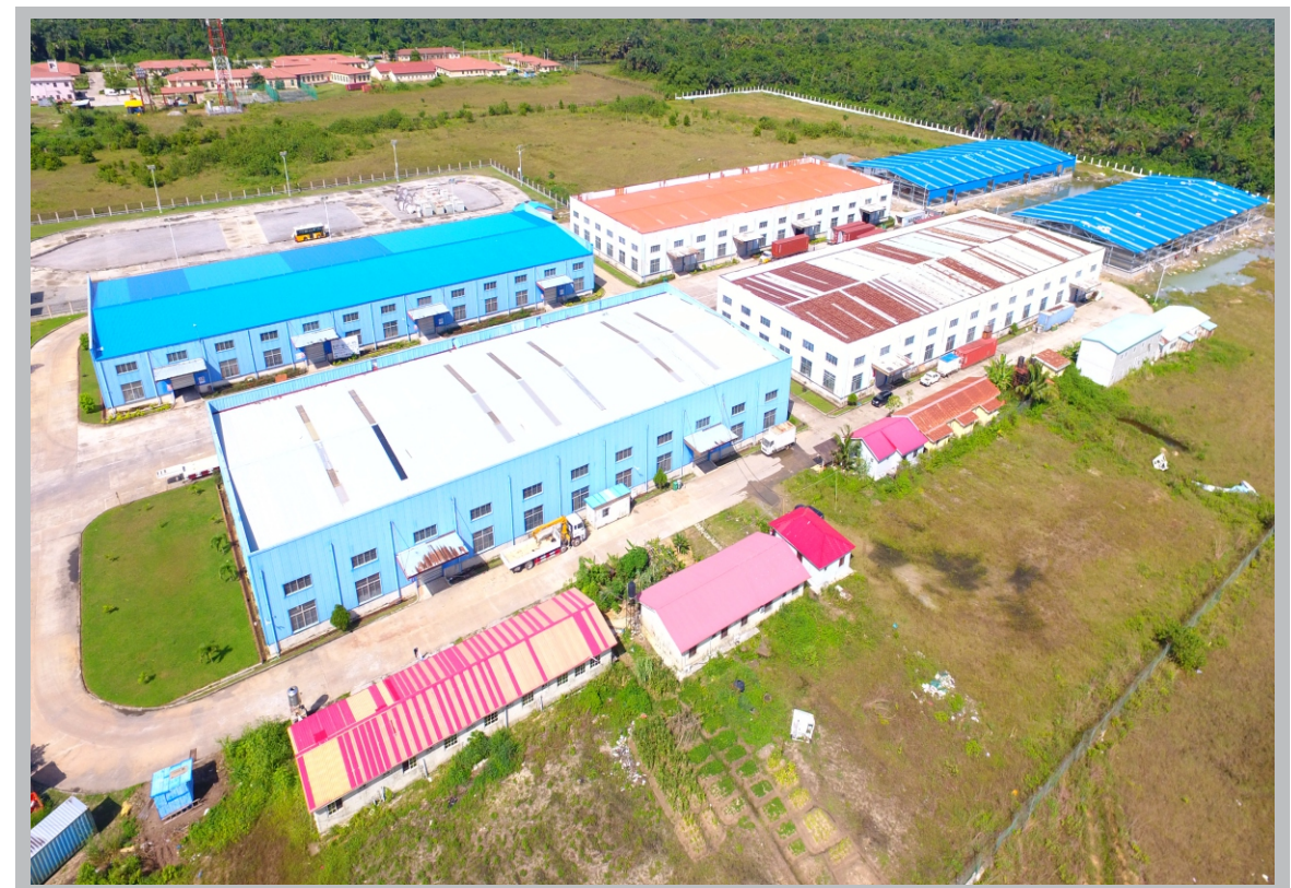
Pre-built Factory Unit