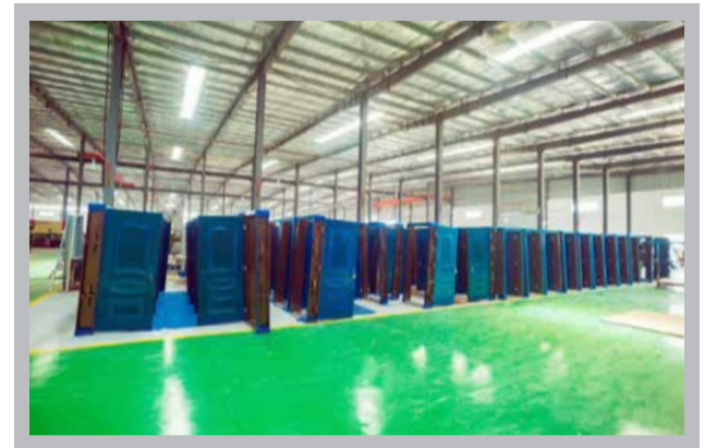
ASLAN NIGERIA FZE operates with over 100 staff manufacturing durable Security Doors for the Nigeria market