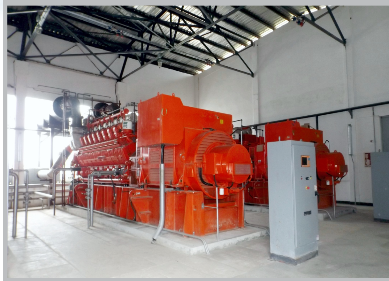
12MW General Electric Waukesha Engine