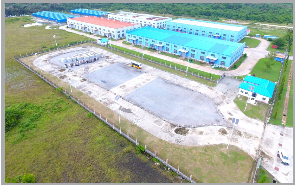
Customs Processing Center