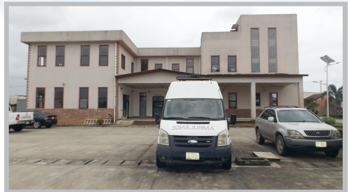
Saint Nicholas Hospital