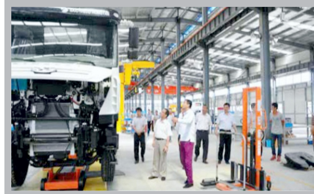
ASIA-AFRICA FZE is a vehicle assembly plant on 40,000sqm of land to assemble Heavy Duty Truck, Buses and Special Purpose Vehicle like fire fighting trucks for export