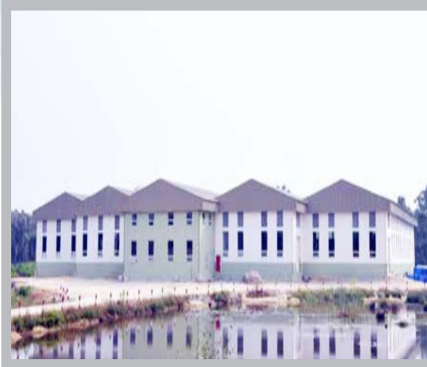
THE CANDEL FZE is a registered first class Agro Chemical Formulation Plant in the Lekki Free Zone with distribution network across Nigeria and Ghana. The Enterprise manufactures series of Pest Control Solution and Liquid Fertilizers to boost Agricultural proceeds in Nigeria.