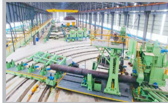
YULONG PIPE FZE specializes in the fabrication of Steel Pipe for both Oil and Gas and Water Works Projects. The Factory currently occupies 18 hectares of land