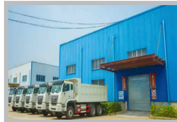
SINOTRUCK FZE assembles different sizes of Dump Trucks for Nigeria market

Lekki Free Zone currently operates uninterrupted power supply and offers additional incentives to manufacturers using local raw materials to produce for export market