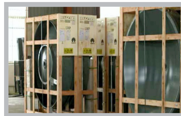
BOLLORE LOGISTICS FZE currently handles of telecommunication accessories for Huawei to Nigeria and West African markets