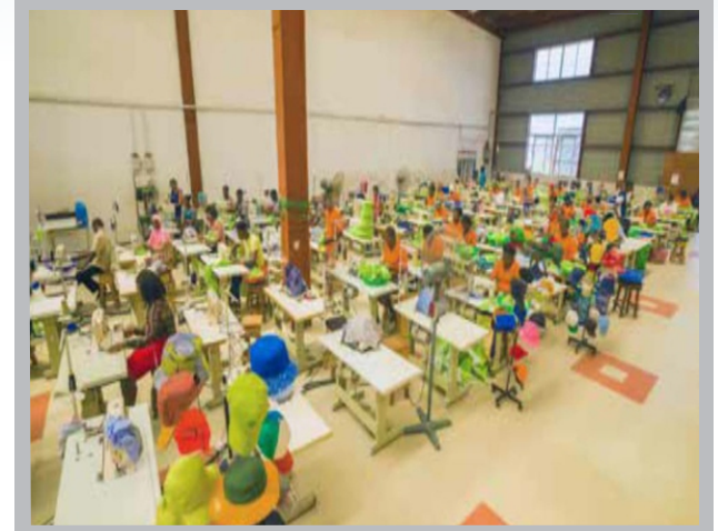
CRONNATURE FZE is an indigenous garment factory operating with over 100 staffs to make garments, uniforms, Men underwear and Sport Wears