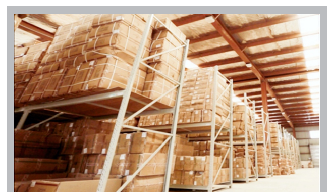
H&Y INTERNATIONAL FZE specializes in the distribution of Wigs and Hair Attachments for Ladies within Nigeria and West Africa